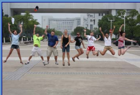
UAIS Students at Shanghai University

Research based student centered learning is the corner stone of the Utica Academy for International Studies.