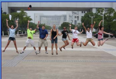
UAIS Students at Shanghai University

Research based student centered learning is the corner stone of the UAIS. Every student is a co-creator of what and how they learn.